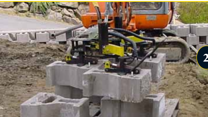
Keysset locks into the center of the 3 Standard units facing the same direction.