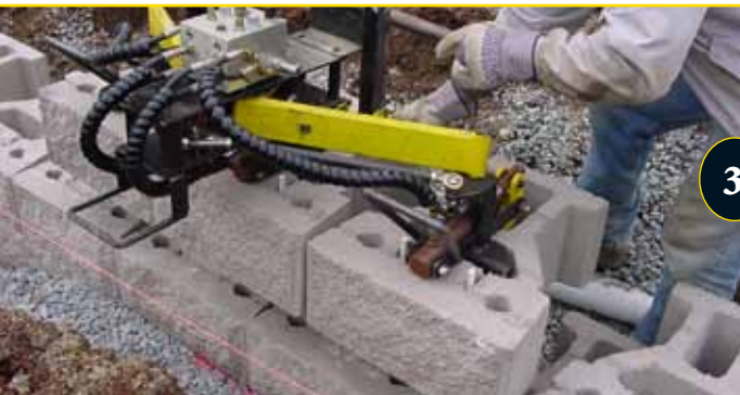
Keysset brings the units into alignment and sets them on the wall.