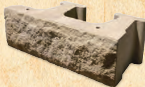
Keystone 133ELITE® Hewnstone

*8" h x 24" w x 11¼/12" d (200 x 600 x 285 mm) Approx. • 95 lbs (43 kg)