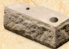
133Elite® 90° Hewnstone Corner*

*8" h x 24" w x 11¼/12" d (200 x 600 x 285 mm) Approx. • 95 lbs (43 kg)