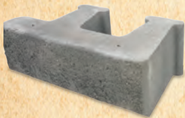
Keystone 133ELITE® KeyKut

The Keystone 133Elite is perfect for large wall applications. Its 8" x 24" face dimension creates a larger-scale look, aesthetically matching the larger wall look and feel, while reducing the number of units required to complete the job. Never before have wall designers had so much flexibility in creating the perfect appearance for their Keystone wall. In addition to conventional textures, Keystone's Sculpterra™ technology can produce units with specially designed natural textures – in combination with the wide variety of colors available in most Keystone products. The Keystone 133Elite satisfies a wide array of design requirements from corners to sweeping curves, offering simply the best combination of strength, beauty, and efficiency on the market.